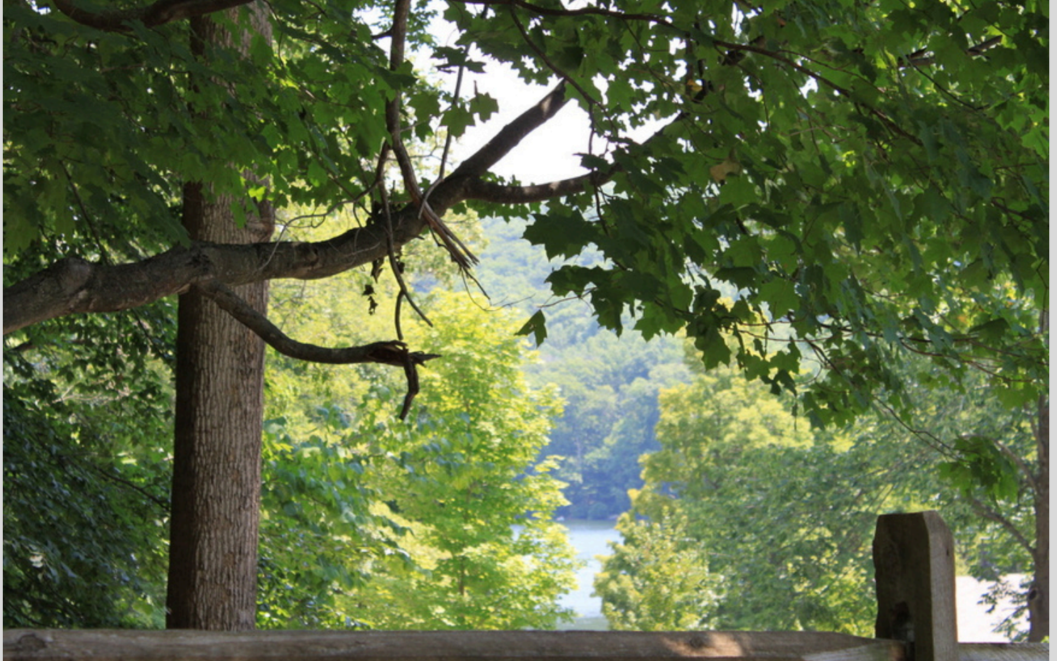
View from the Nature Center @ Cunningham Falls Houck Area.

The Manor Area , off of US 15, is home to the Manor camping loop and has a mixture of electrical and traditional sites, though these electrical sites can only hold up to thirty foot trailers. Each camping pad comes with a picnic table and a fire pit/grill, and can hold two passenger vehicles. The entire loop is pet friendly. In the middle of the loop, there is a bathhouse available and a dishwashing station to wash your dishes.