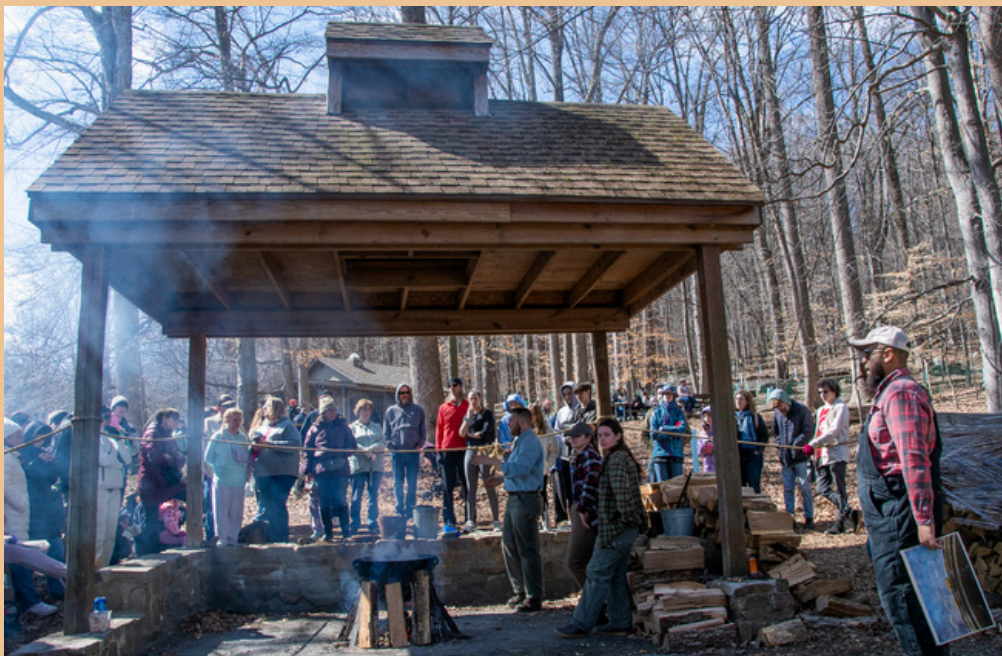
Sap Boiling Demonstrations @ The Sugar Shack