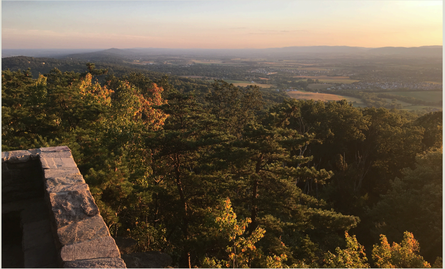
Scenic Overlook, Gambrill State Park