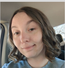
by Emma Ford Friends Member and Volunteer

Some other amenities that the campgrounds offer are water supply and dump stations. Each camping loop has around two to three water spigots that have potable water. This can be used to replenish your RV's water tank. You can cook with this water too. The William Houck Area and the Rock Run Area have dump stations so RVs can empty their tanks. If you are camping with us, you can use it for free. for people passing through, the cost is only $5.00.