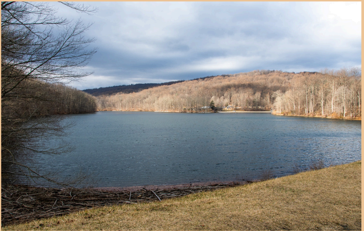
Cunningham Falls State Park, Hunting Creek Lake