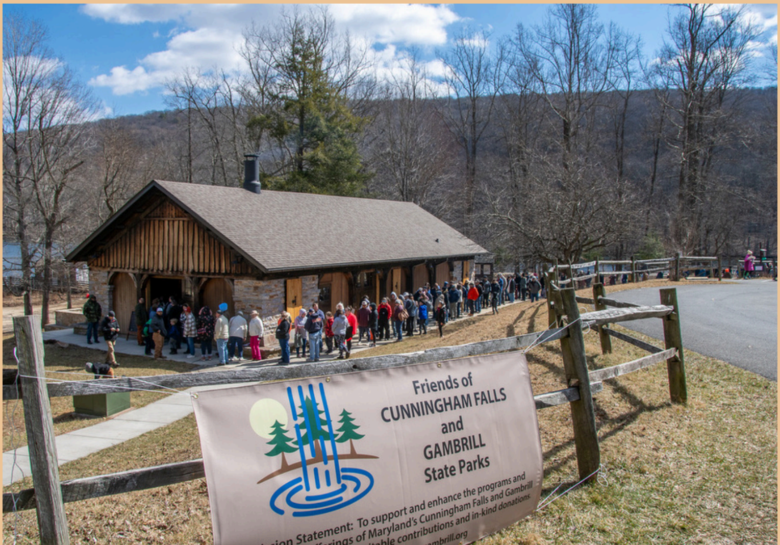
The Lakeside Grill where lots of pancakes were made.